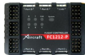
FC1212-P Flight controller