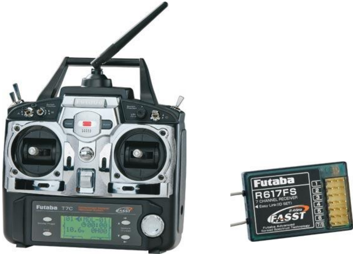
Futaba 7C 2.4GHZ Remote Controller with receiver.