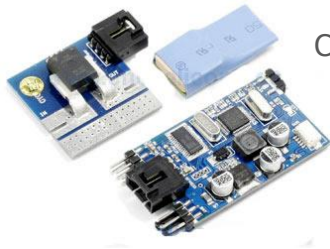
Cyclops Easy OSD V1.5 GPS module 10Hz