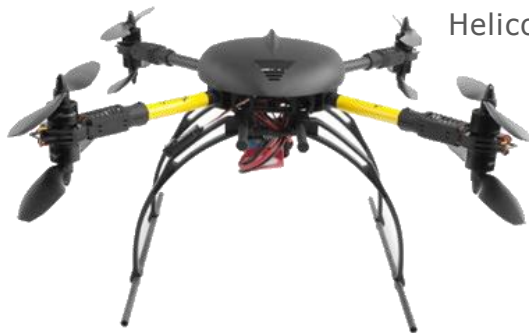
Helicopter main body