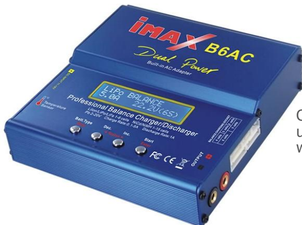
Charger iMAX B6AC for up to 6cells Lipoly batteries with cell balancer.