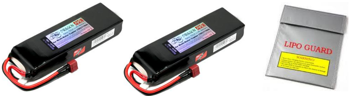
2pcs Dragon 351P Lipoly batteries 5850mAh - 30min Flying time each & Lipo charging bag.