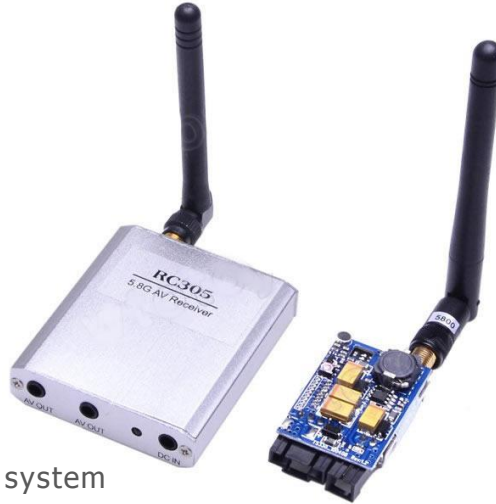
Dragonfly FPV TS351 & RC305 5.8GHZ Wireless Composite Video system