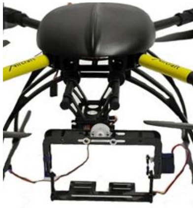
Camera base with Pan Tilt remote function