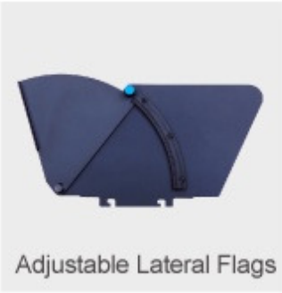
Adjustable Lateral Flags