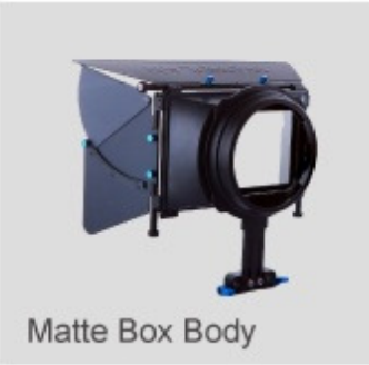
Matte Box Body