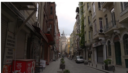
Wide angle (28.8 mm)

The high-performance Sony G Lens provided with the HXR-NX3 offers an expansive 28.8 mm (35mm full-frame format equivalent) angle of view at the wide end, with a 20x optical zoom range that will easily cover most shooting situations. When more reach is required, Clear Image Zoom employs Super Resolution Technology to provide excellent image quality at a 40x range.