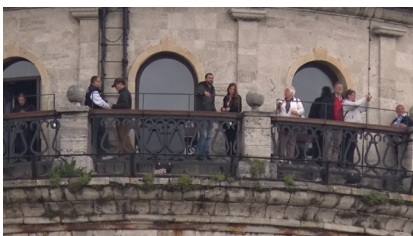
40x Clear Image Zoom (1152 mm)