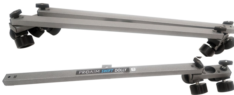
Swift Dolly with Wheels attached

Please inspect the contents of your shipped package to ensure you have received everything that is listed below.