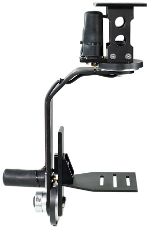
Jr. Pan-Tilt Head

Please inspect the contents of your shipped package to ensure you have received everything that is listed below.