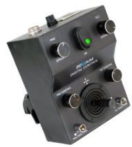
12V Joystick Controller