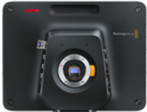
Blackmagic Studio Camera HD