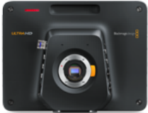
Blackmagic Studio Camera 4K